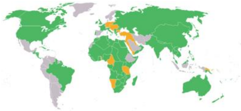
Map of the participants in World War I: Allied Powers in green, Central Powers in orange, and neutral countries in grey