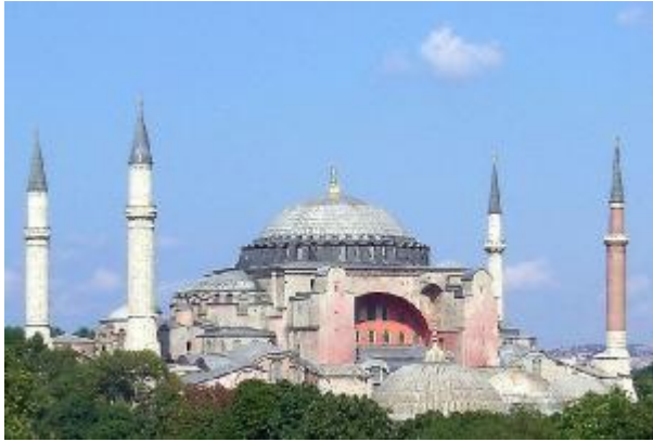
Picture 1: The Hagia Sophia of Constantinople, once the greatest cathedral in all of Christendom

Once the Western Empire fell to Germanic incursions in the 5th century, the (Roman) Church became for centuries the primary link to Roman civilization for medieval Western Europe and an important channel of influence in the West for the Eastern Roman, or Byzantine , emperors.