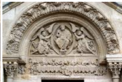
The Romanesque tympanum of Vézelay Abbey, Burgundy, France, 1130s.