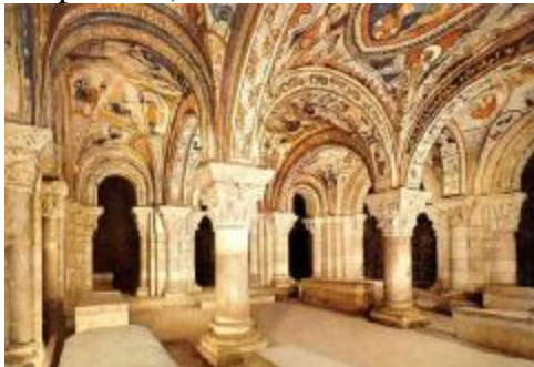
Painted ceiling of a Spanish crypt

B) Romanesque art developed in the period from about 1000 to the rise of Gothic art in the 12th century , in conjunction with the rise of monasticism in Western Europe. The style developed initially in France, but spread to Christian Europe, to become the first medieval style found all over Europe , though with regional differences. The arrival of the style coincided with a great increase in church-building, and in the size of cathedrals and larger churches; many of these were rebuilt in subsequent periods, but often reached roughly their present size in the Romanesque period. Romanesque architecture is dominated by thick walls, massive structures conceived as a single organic form, with vaulted roofs and round-headed windows and arches . (see pictures)