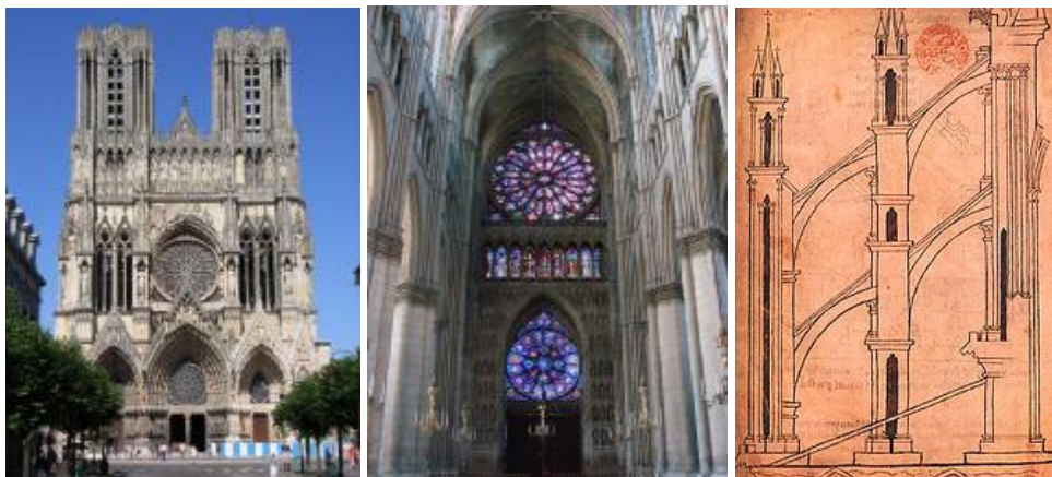
The western façade of Reims Cathedral, France; The interior of the western end of Reims Cathedral; drawing of a flying buttress

Secular art came in to its own during this period with the rise of cities, foundation of universities , increase in trade, the establishment of a money-based economy and the creation of a bourgeois class who could afford to patronize the arts. Increased literacy and a growing body of secular literature encouraged the representation of secular themes in art. With the growth of cities, trade guilds were formed and artists were often required to be members of a painters' guild —as a result, because of better record keeping, more artists are known to us by name in this period than any previous ;