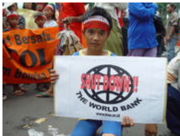
World Bank protester, Jakarta Indonesia , 2004.