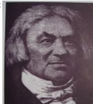
Christian Jürgensen Thomsen (1788–1865)