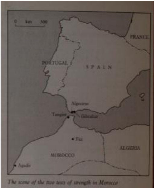
Morocco: cities of Tangier, Algericas, Fez, Agadir

afraid that the Germans would make Agadir into a rival base for Germany. The British navy was told to make ready for the war. At the last moment German warships were ordered to leave Agadir and the war was avoided.