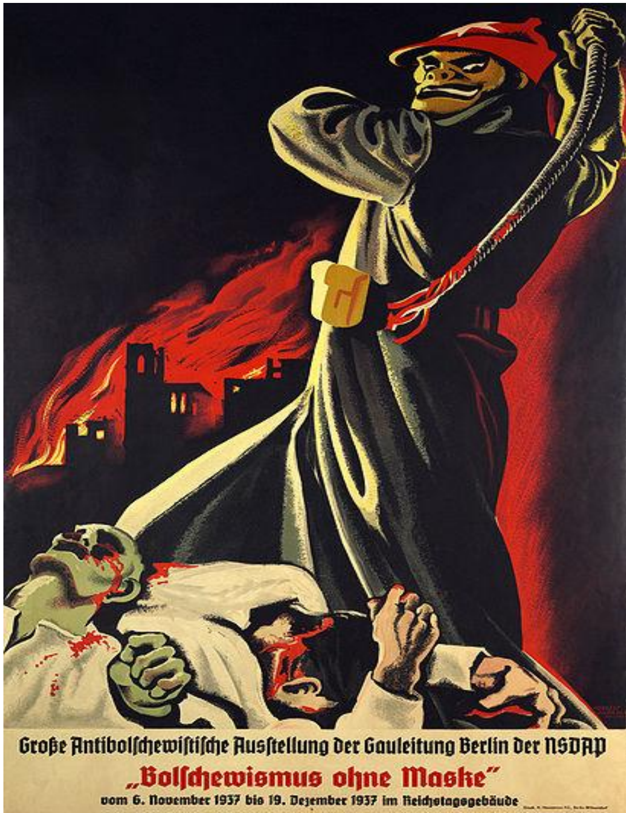
Anti-Bolshevik Nazi propaganda poster. The translated caption: "Bolshevism without a mask - large anti-Bolshevik exhibition of the NSDAP."