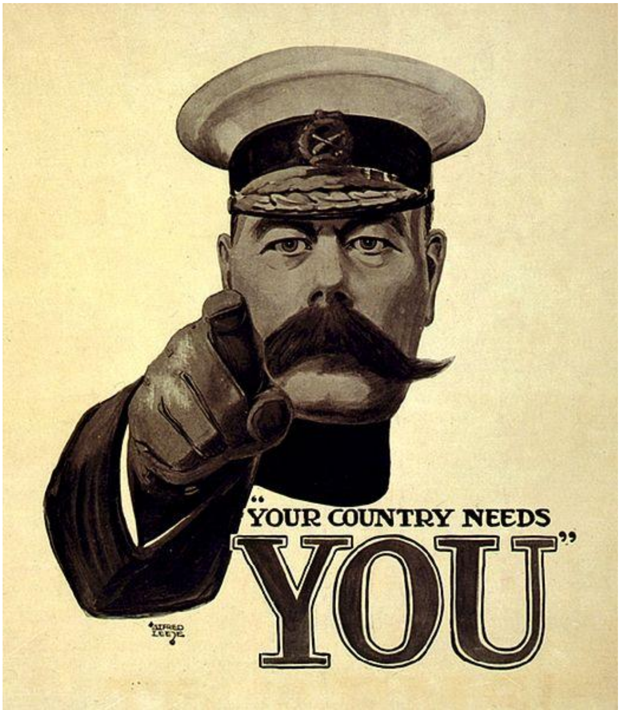
Original poster of Lord Kitchener