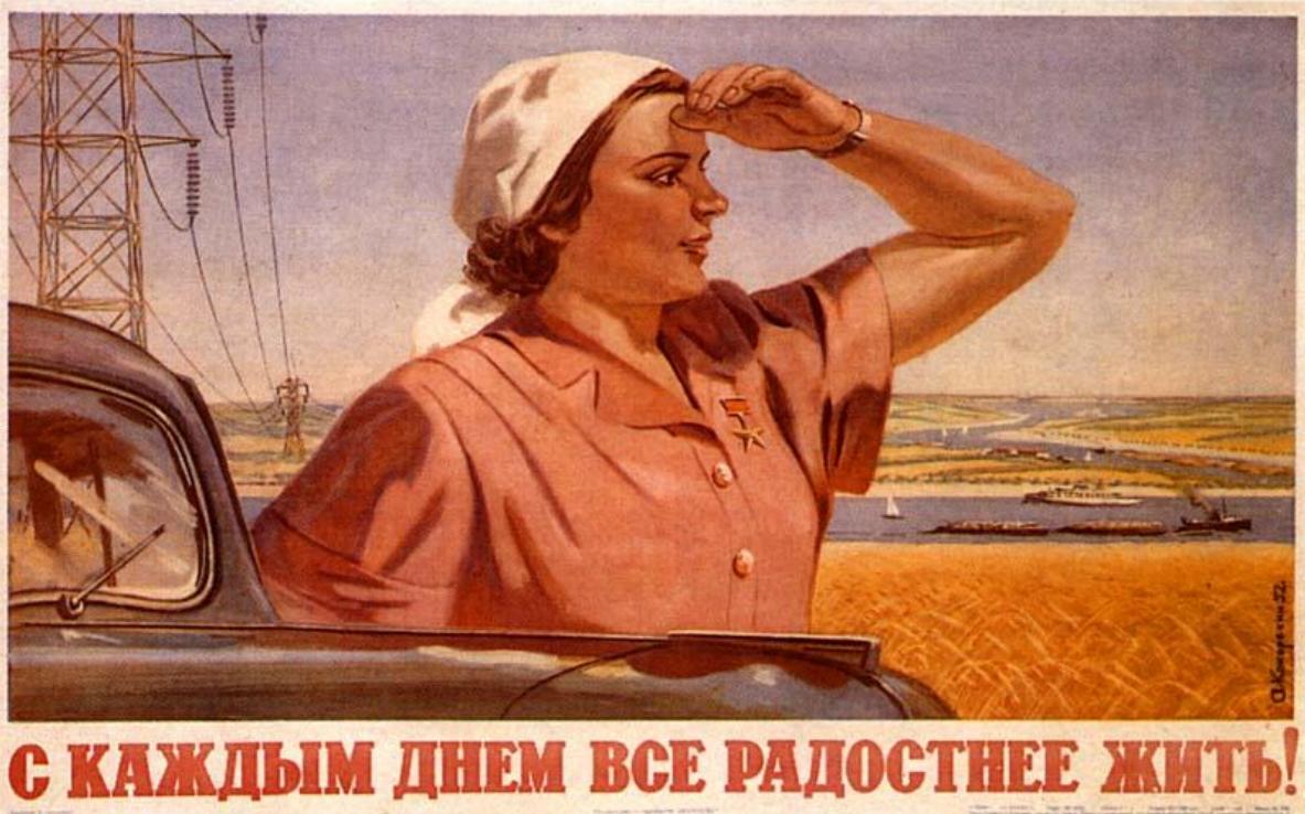
"Day after day, life becomes even happier!"