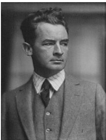
James Montgomery Flagg