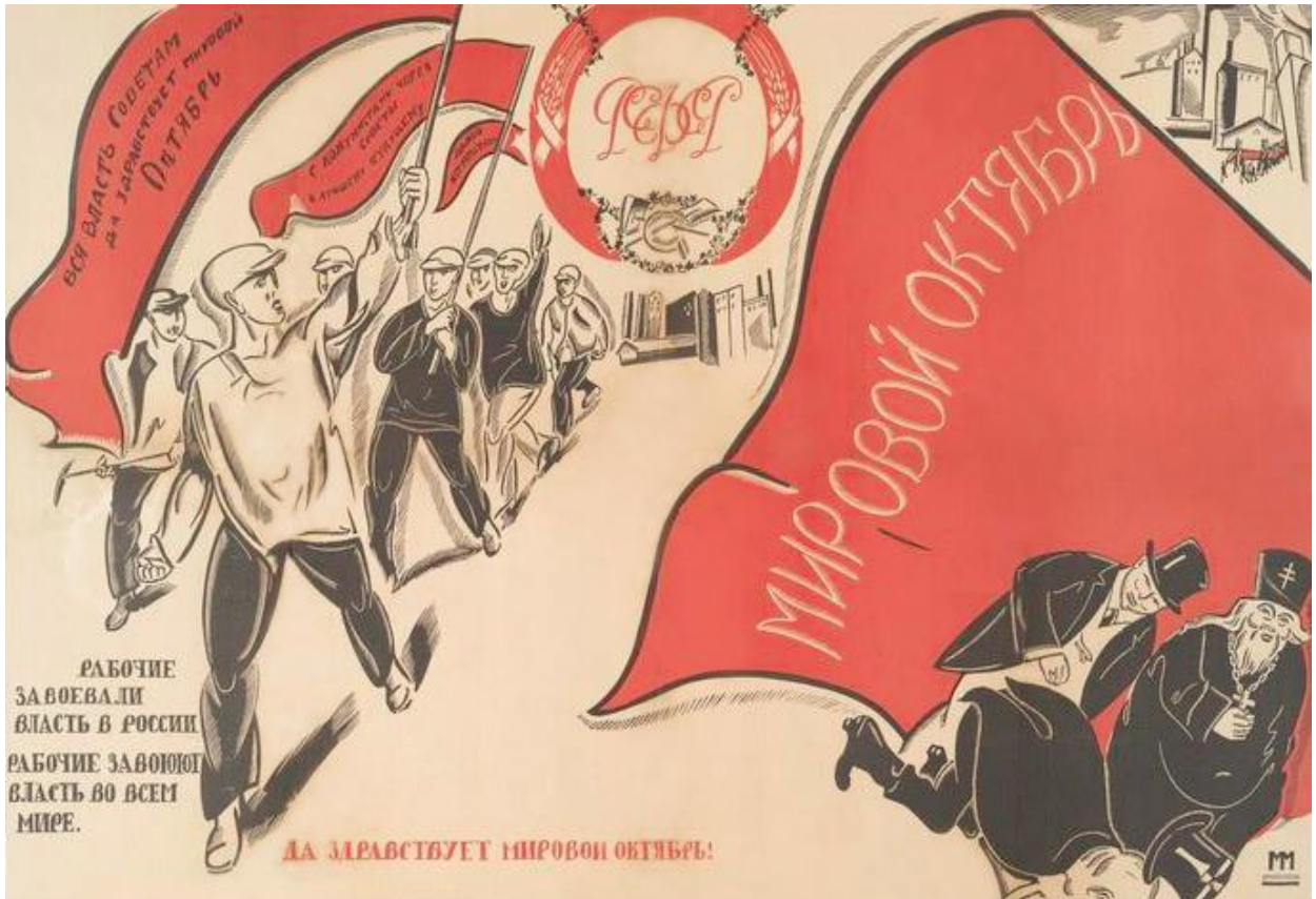
October Revolution poster