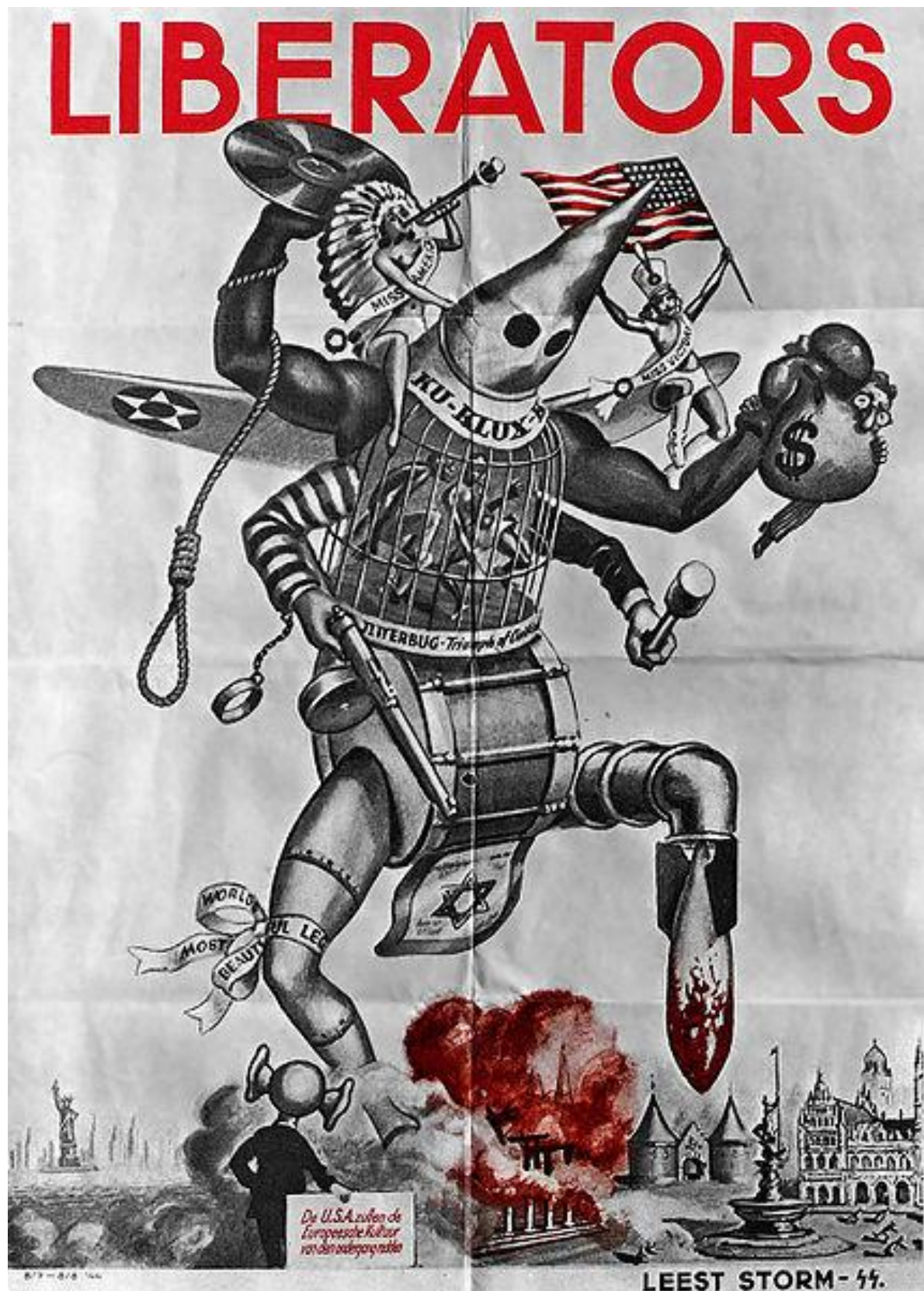
Nazi Poster depicting American liberators as monster.