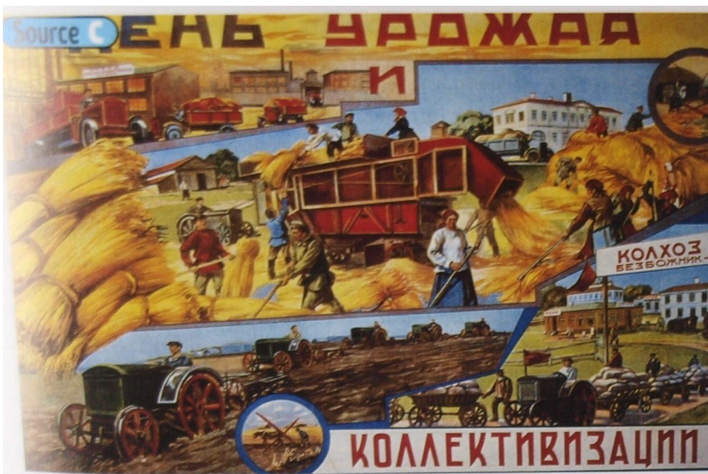
Pic. on the left: A Soviet government poster, contrasting the modern methods used on collective farms with the old-fashioned methods of the past.