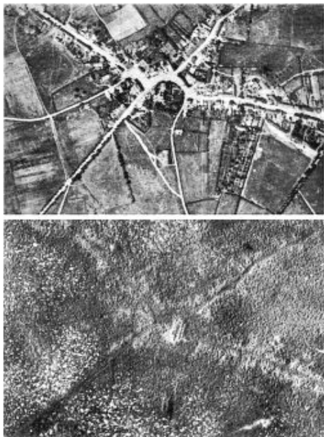
Passchendaele village, before and after the 3rd Battle of Ypres

People in Britain were horrified by the reality of the battle (shown in cinemas)