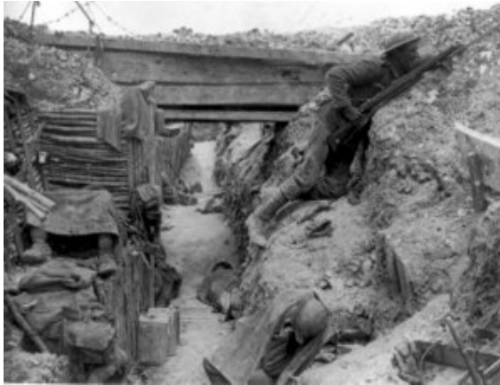
A Cheshire Regiment sentry in a trench near La Boisselle during the Battle of the Somme , July 1916

Both sides had plenty of men and plenty of money for ammunition and weapons, so Generals kept sending more and more men 'over the top' - even though it didn't achieve any obvious success.