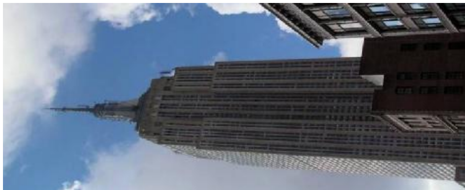
The Empire State Building , New York, USA.

The World War I defeat of Germany in 1918 halted the airship business temporarily. But in the 1920s civilian zeppelins became popular. Their heyday was during the 1930s when the airships LZ 127 Graf Zeppelin and LZ 129 Hindenburg operated regular transatlantic flights from Germany to North America and Brazil. The Art Deco spire of the Empire State Building was originally if impractically designed to serve as a dirigible terminal for Zeppelins and other airships to dock. The Hindenburg disaster in 1937 4 , along with political and economic issues, hastened the demise of the Zeppelin .