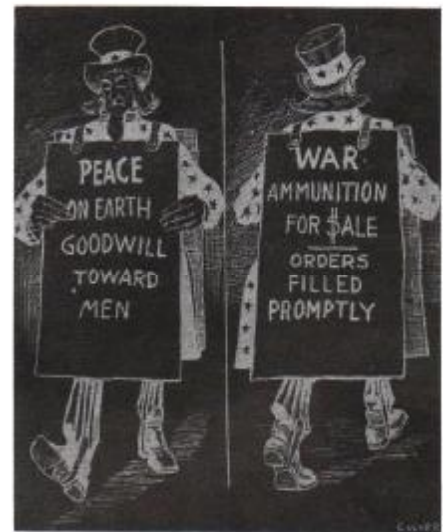
An American cartoon commenting on Wilson's about-turn

Wilson took America into World War I as a war to make "the world safe for democracy". Although he tried to make involvement in the war a matter of conscience, there were business reasons. If Germany sank the ships, trade would stop. This would mean unemployment in the USA. Depression could set in. If the Allies lost the war, they would not pay back the money America had lent them.