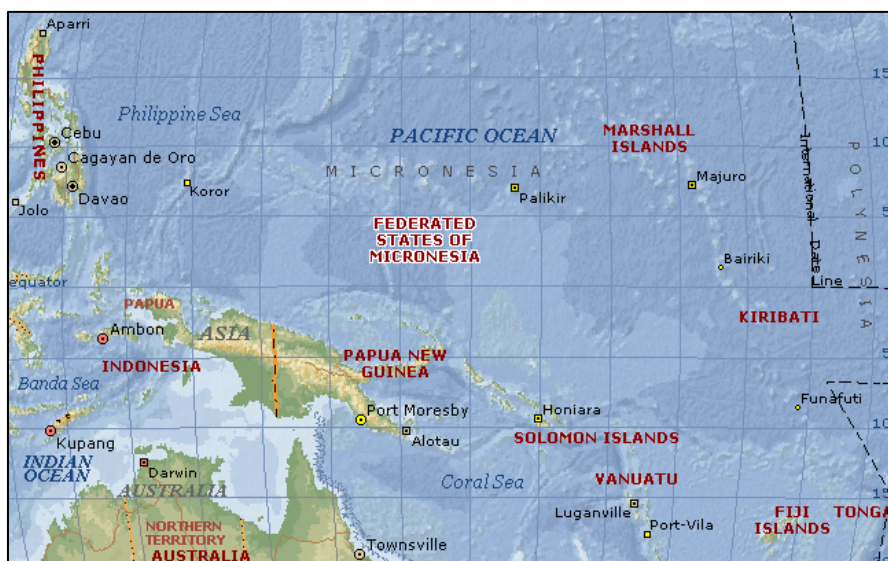
Figure 2: Micronesia

Western Micronesia, comprising Palau (Caroline Islands) and the Mariana Islands, was first settled about 3,500 years ago, probably by peoples from Indonesia or the Philippines. Eastern Micronesia was settled at about the same time, possibly by people from eastern Melanesia. Blood type analysis has shown that, contrary to earlier beliefs, Micronesians are distinct from Australian, Asiatic, and Polynesian races.