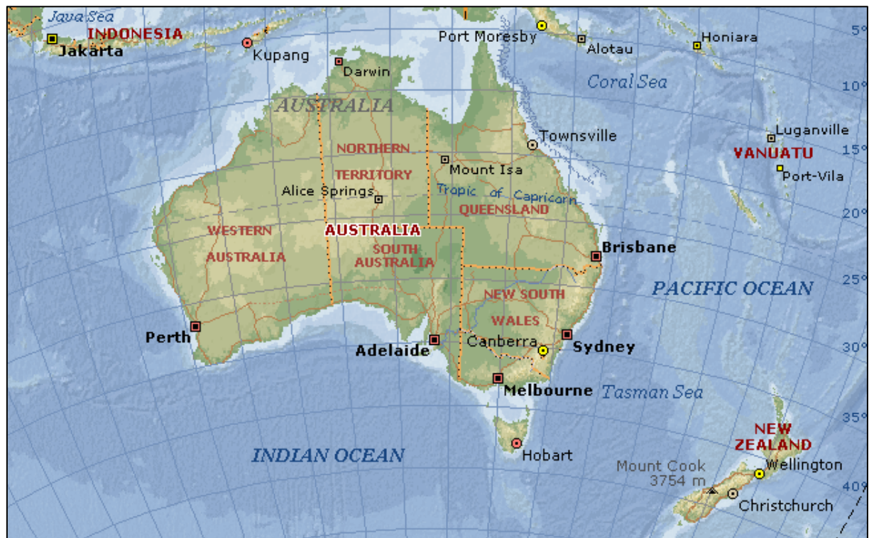
Figure 1: Australia

= made up of 6 states and 2 territories: