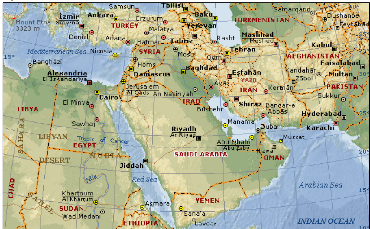
Figure 1: South-West Asia (Middle East)

Well-watered southern coastal fringe of the Arabian Peninsula = lush vegetation covers the land and fruit trees flourish. Established communities in this region make their living mostly through agriculture. This southern region is bordered by several large bodies of water – the Mediterranean Sea to the NW, the Red Sea to the W, the Gulf of Aden and the Arabian Sea to the S and the Persian Gulf and the Gulf of Oman to the E. Narrow mountain ranges define its W + S + SE edges, and the historically significant Fertile Crescent lies between the Tigris and Euphrates rivers, to the north-east (Figure 1).