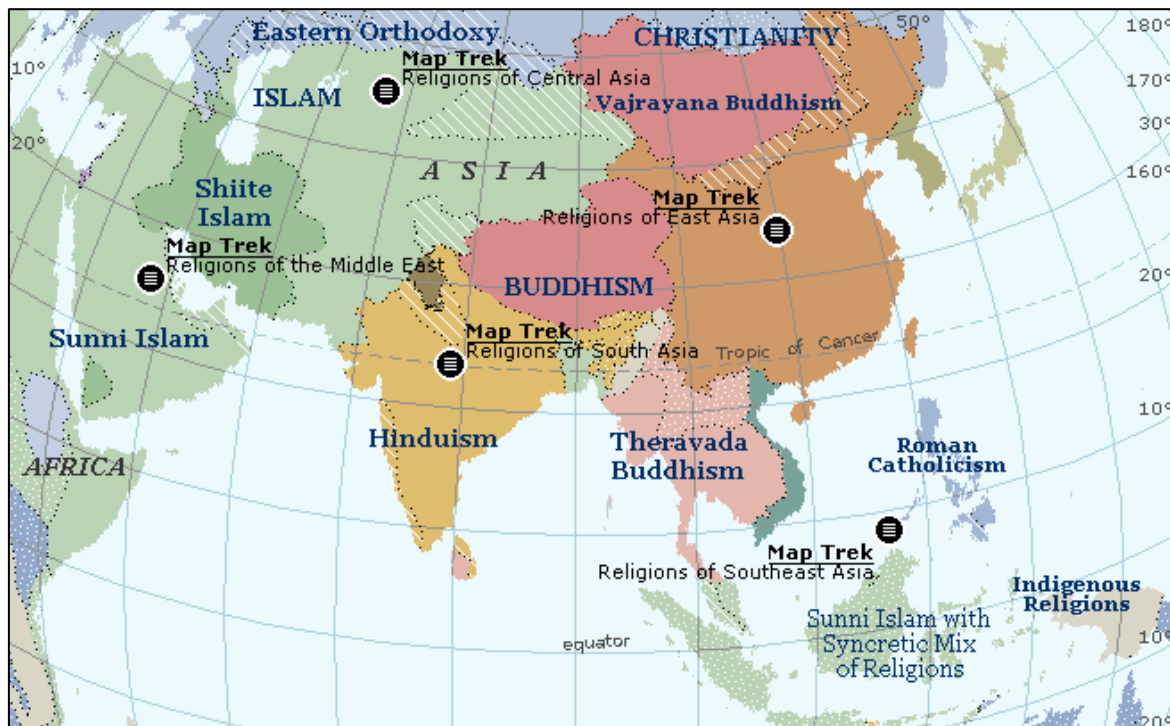
Figure 3: Distribution of major Asian religions