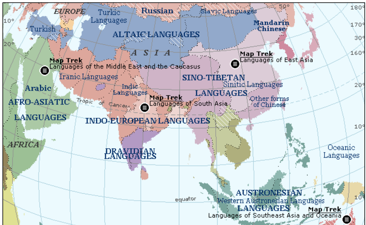
Figure 4: Distribution of major Asian languages