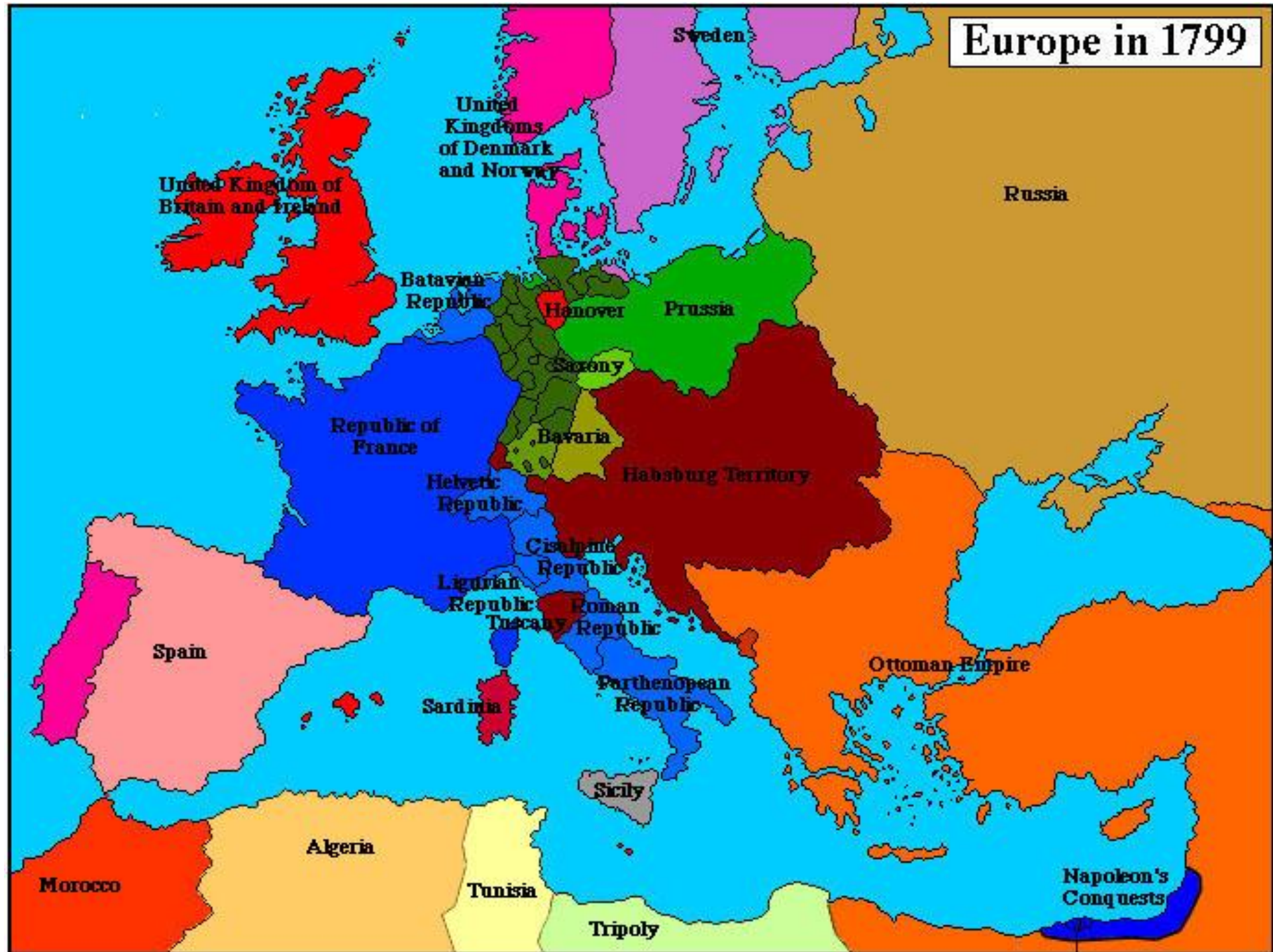
Europe in 1799