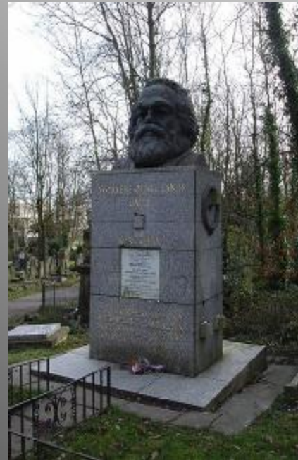
Karl Marx's Tomb at Highgate Cemetery London