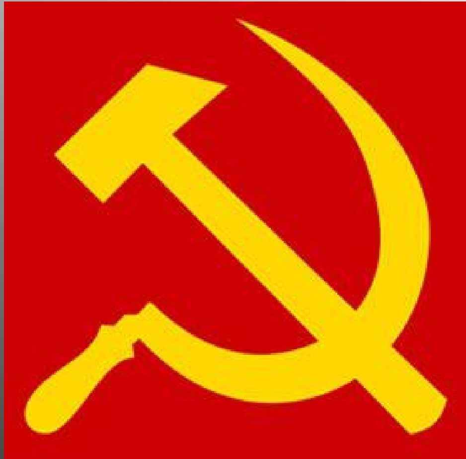
Hook & Hammer