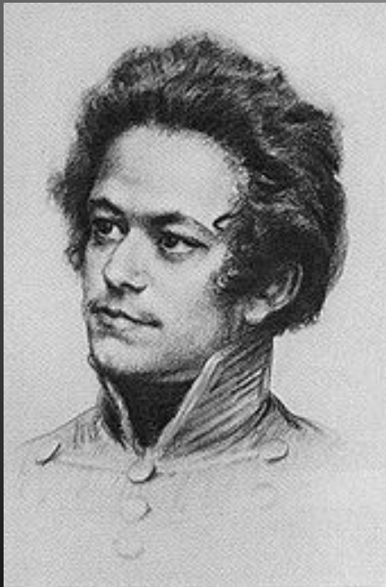
Karl Marx as a teenager