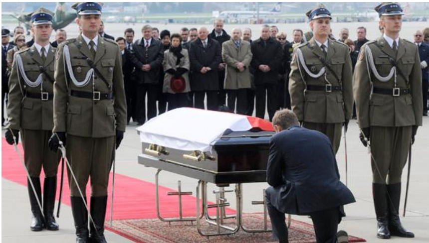
The casket of Lech Kaczynski , Polish President at the airport in Warsaw after he died in the crash of the airplane heading to Katyn in April 2010. Donald Dusk, Polish Prime Minister, on his knee.