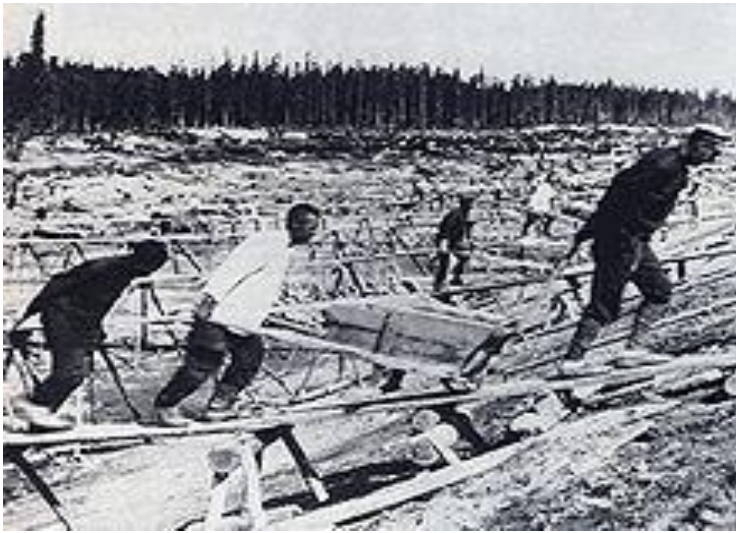
Later, there were also the victims of Stalin's purges.